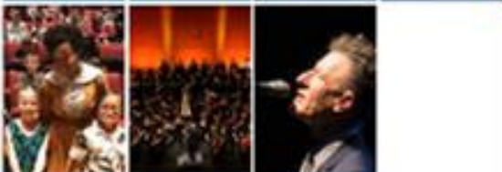
Kids and the Arts, Blue Performance, TOArts Presents