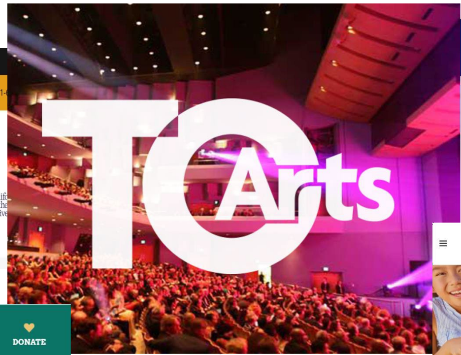
Dancing with Our Future Stars "DWOFS"