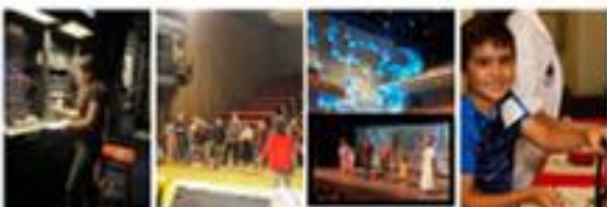
Advanced Theatre, Youth Arts Leadership, Visual Arts, Activities